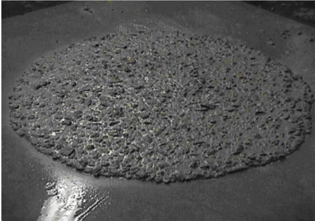
Figure 2. VSI = 0, stable