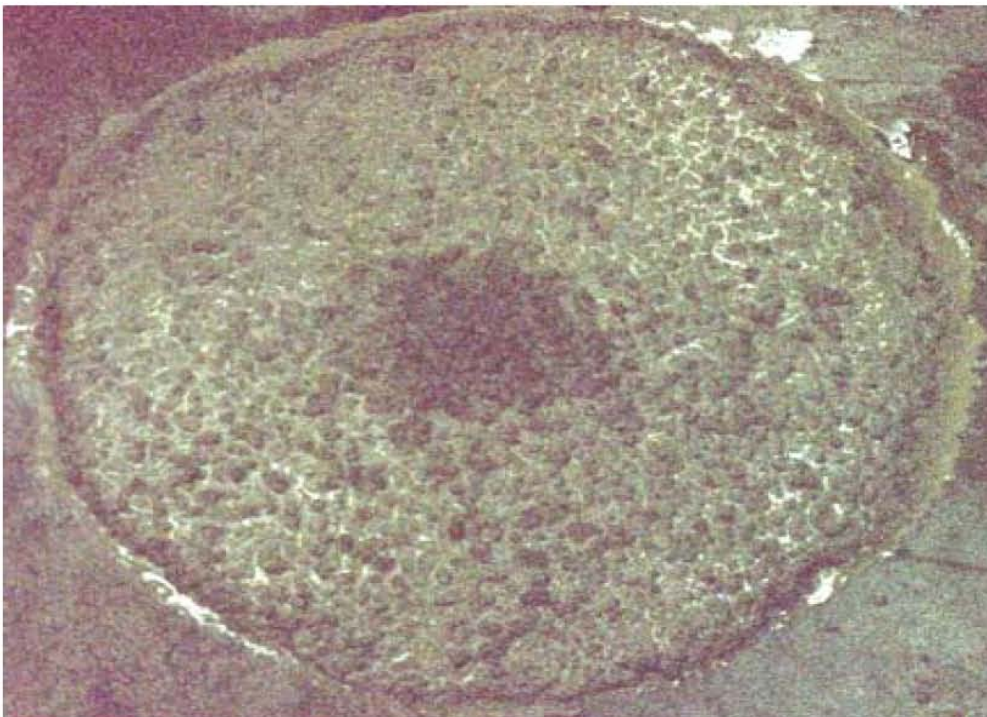
Figure 9. VSI = 3, unstable