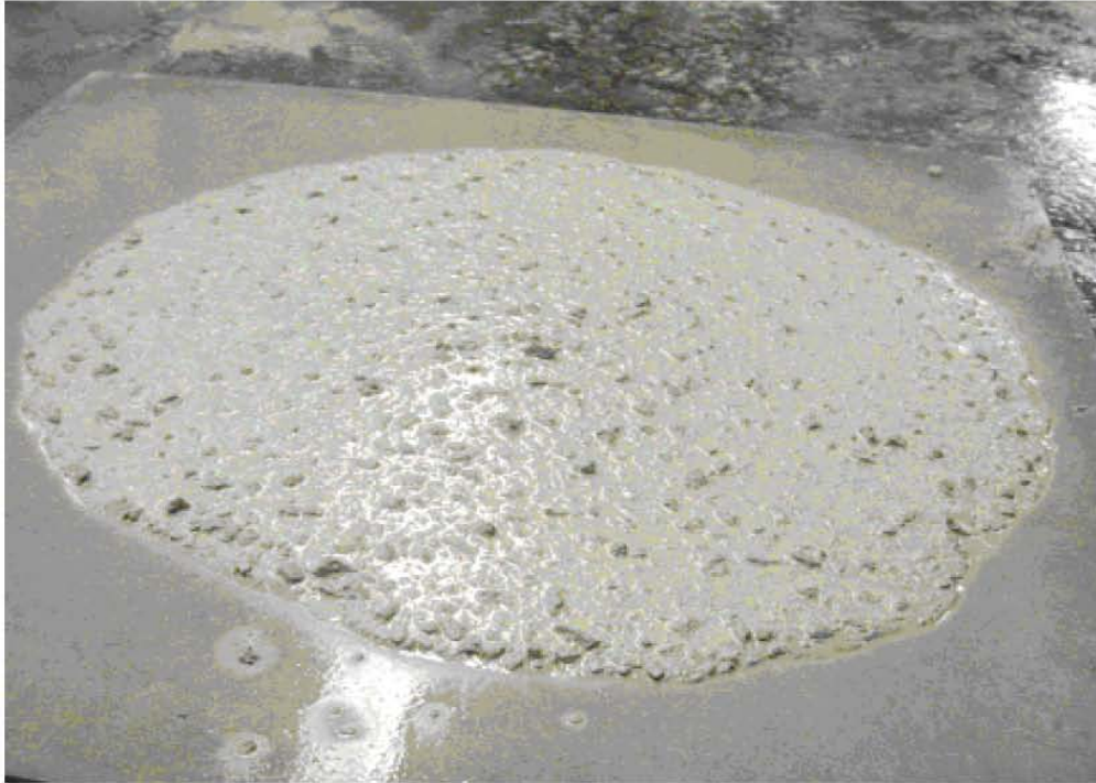
Figure 6. VSI = 2, unstable