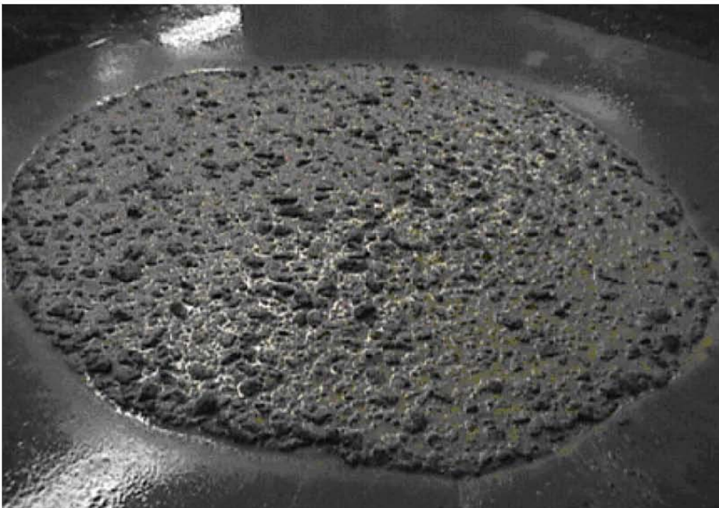
Figure 5. VSI = 1, stable