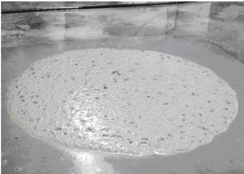
Figure 7. VSI = 2, unstable