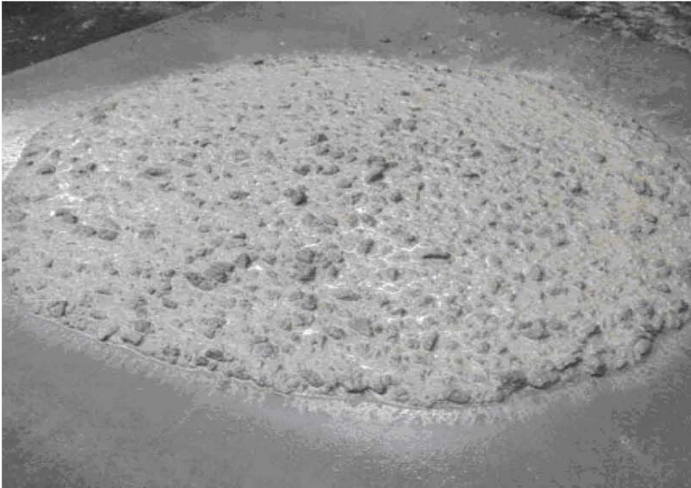
Figure 4. VSI = 1, stable