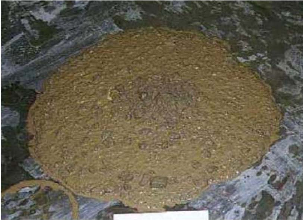
Figure 8. VSI = 3, unstable