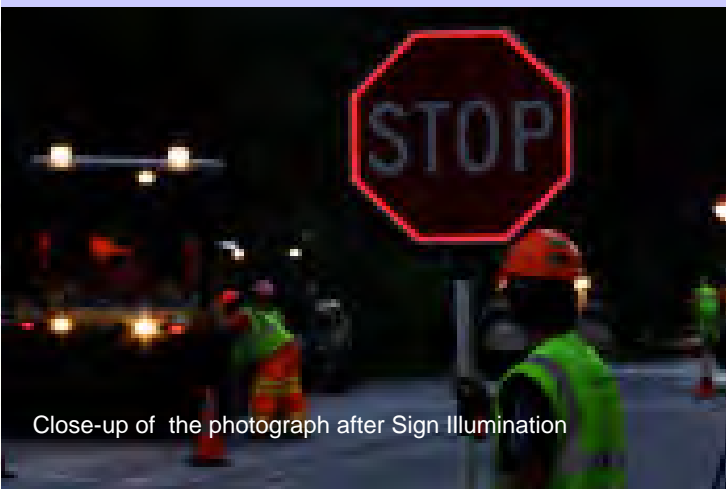
Close-up of the photograph after Sign Illumination

The Nevada Department of Transportation is considering these devices for work zone areas to enhance the safety of our employees.