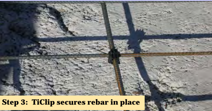
Step 3: TiClip secures rebar in place