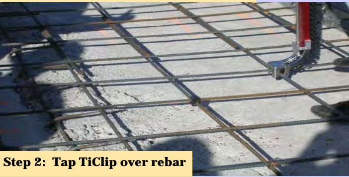
Step 2: Tap TiClip over rebar