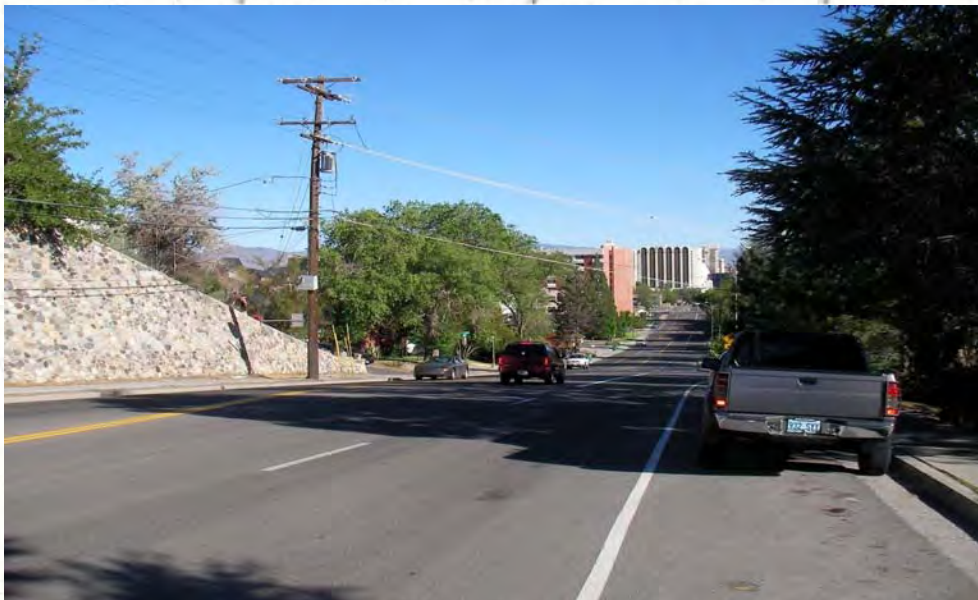
An example of a difficult-to-see marked crosswalk after the hill