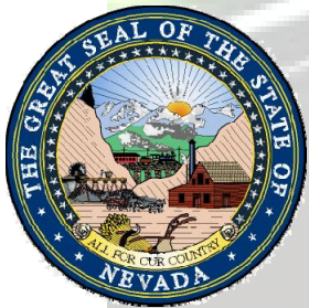
Jim Gibbons Governor